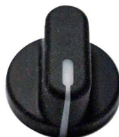
5941E, 5921E, 5931E