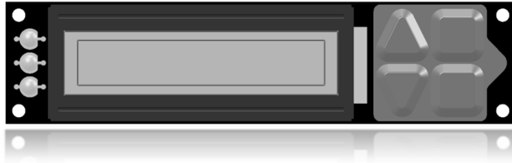
Figure 1: LK162A-4T Display

The LK162A-4T is an intelligent alphanumeric liquid crystal display designed to decrease development time by providing an instant solution to any project. In addition to the RS232, TTL and I2C protocols available in the standard model, the USB communication model allows the LK162A-4T to be connected to a wide variety of host controllers. Communication speeds of up to 115.2kbps for serial protocols and 100kbps for I 2 C ensure lightning fast display updates.