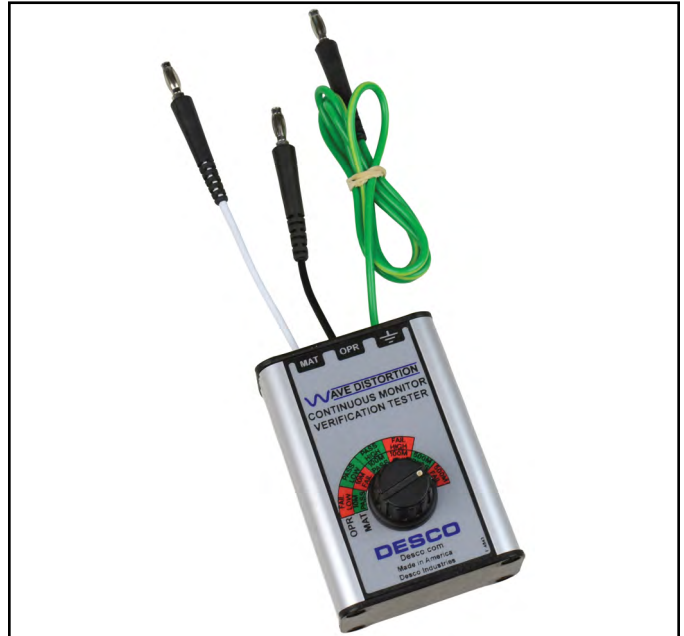
Figure 9. Desco 98221 Wave Distortion Monitor Verification Tester