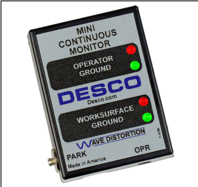
Figure 1. Desco Mini Monitor