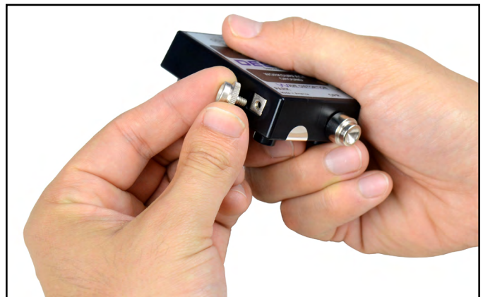
Figure 7. Changing the park snap on the 19243 Mini Monitor

The 19243 Mini Monitor includes an interchangeable 10mm park snap and 10mm banana jack adapter for operators who use wrist cords with 10mm terminations. Use the park snaps' knurled rims to unscrew the 4mm park snap from the monitor and install the 10mm park snap to the monitor. Plug the 10mm operator jack adapter into the monitor's operator jack.