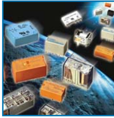
Schrack PCB Relays