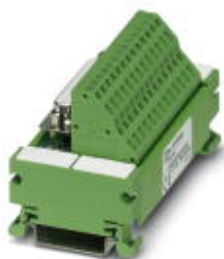
VARIOFACE module, with spring-cage connection and D-Subminiature socket strip, for mounting on NS 35/7.5, 25-pos.

Please be informed that the data shown in this PDF Document is generated from our Online Catalog. Please find the complete data in the user's documentation. Our General Terms of Use for Downloads are valid ( http://phoenixcontact.com/download )