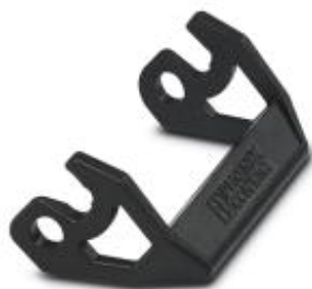
Replacement plastic single locking latch, for HC-EVO-D15.....BK housing

Please be informed that the data shown in this PDF Document is generated from our Online Catalog. Please find the complete data in the user's documentation. Our General Terms of Use for Downloads are valid ( http://phoenixcontact.com/download )