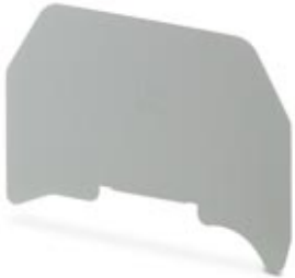
Separating plate, Length: 61 mm, Width: 0.8 mm, Height: 45.5 mm, Color: gray

Please be informed that the data shown in this PDF Document is generated from our Online Catalog. Please find the complete data in the user's documentation. Our General Terms of Use for Downloads are valid ( http://phoenixcontact.com/download )