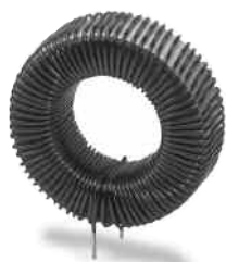
VERTICAL SELF LEADED MOUNT