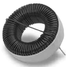
HORIZONTAL SELF LEADED MOUNT