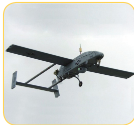
UAV Flight Control

The AHRS440 combines highly reliable MEMS sensors (gyros and accelerometers) with low noise magnetometers to provide accurate attitude and heading in a small and rugged environmentally-sealed enclosure. The AHRS440 provides consistent performance in challenging operating environments and is user-configurable for a wide variety of applications.