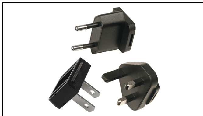
Figure 2. Interchangeable power adapter plugs included with the Mini Zero Volt Ionizer 2