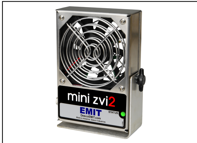
Figure 1. EMIT 50642 Mini Zero Volt Ionizer 2