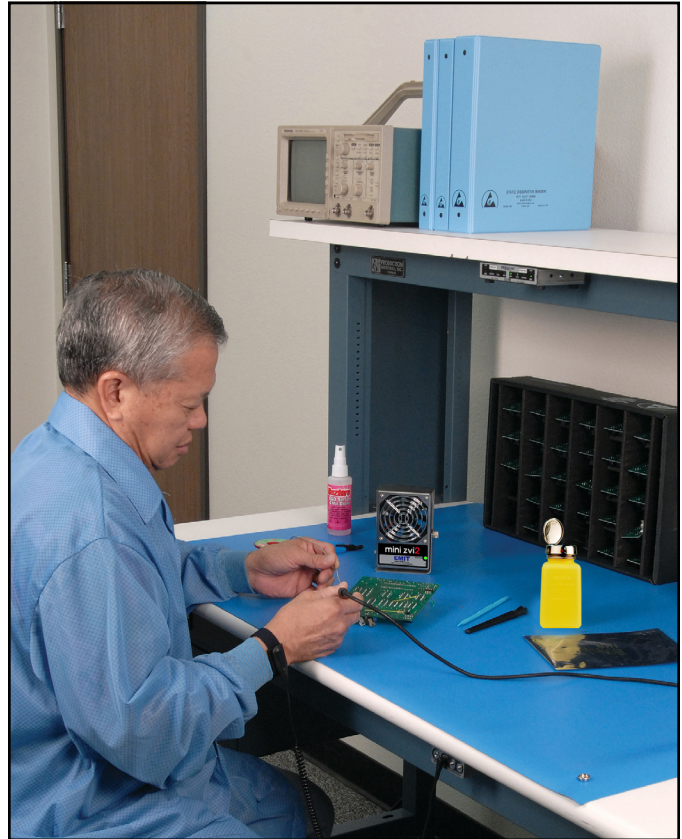
Figure 4. Using the Mini Zero Volt Ionizer 2 at a workstation.