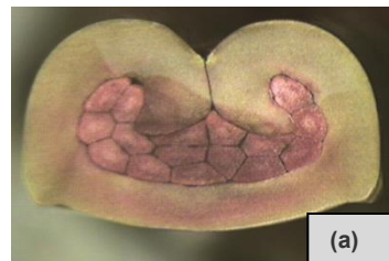
Significant flash can be generated with excessive anvil to crimper clearance, as shown by nominal design condition (a) and +0.003 in over nominal condition (b)

Dimensional control is clearly critical.