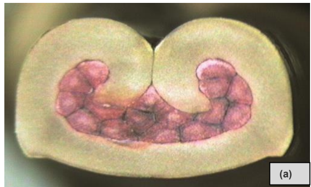
Cross Sections Showing Minimum (a) and Maximum (b) Area Index per Terminal Specification—a Variation of \pm 3.5\%

Therefore, varying the CW by 2% would result in a CH variation of 2%, or 0.0014 in. At a CH tolerance of \pm 0.002 in, 35% of the total CH tolerance would be used by a 2% variation in CW. Thus, the importance of crimp width control is obvious when tooling is changed during a production run.