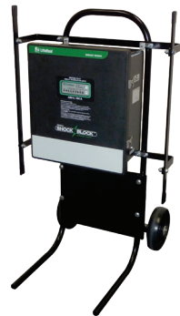
AC6000-CART-00 Two-wheeled Cart Optional for mounting ISB to allow for moving the unit while power is off