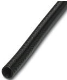
Polyamide protective hose, inflammability class V0, UV resistant

Please be informed that the data shown in this PDF Document is generated from our Online Catalog. Please find the complete data in the user's documentation. Our General Terms of Use for Downloads are valid ( http://phoenixcontact.com/download )