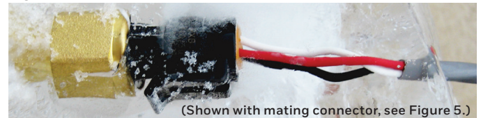
Figure 2. PX3 Series External Freeze/Thaw Resistance