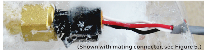
Figure 2. PX3 Series External Freeze/Thaw Resistance