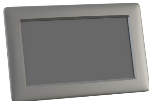
uLCD-70DT Mounted in 7.0" Bezel - Front