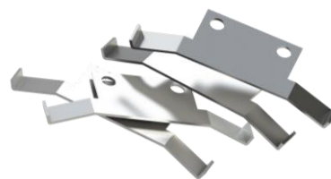
Type 2 Spring Clips