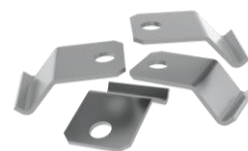
Type 1 Spring Clips