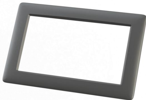
Bare 7.0" Bezel - Front