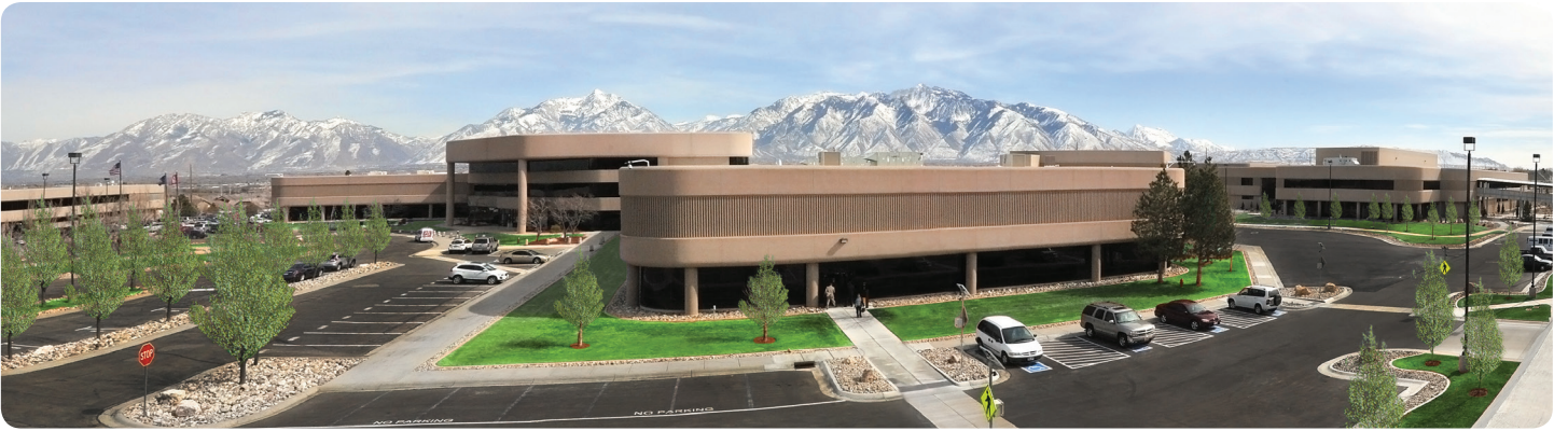
Merit Sensor is based in Salt Lake City, Utah