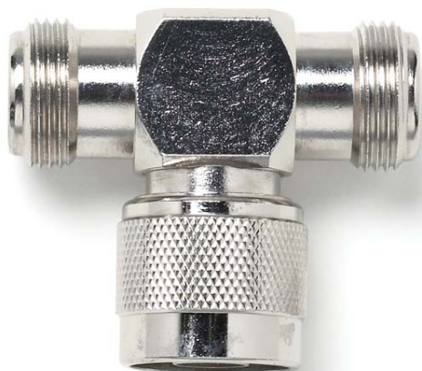
Model 73044 N Type "T" Jack-Plug-Jack Adapter