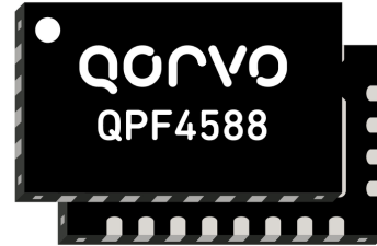
24 Pin 5x3 mm QFN Package

The QPF4588 integrates a 5 GHz power amplifier (PA), regulator, single pole two throw switch (SP2T), bypassable low noise amplifier (LNA) and coupler into a single device