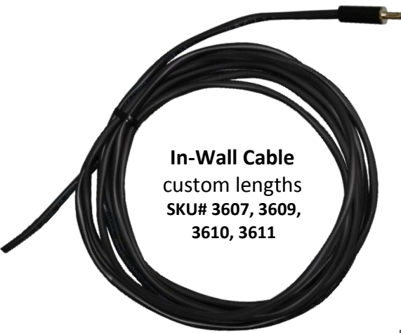
In-Wall Cable custom lengths SKU# 3607, 3609, 3610, 3611

Inspired LED's unique line of Interconnect Accessories are compatible with 3.5mm x 1.3mm DC input/output jacks. Cables are available in standard or custom lengths, and all interconnect products combine easily with Inspired LED flex strips and LED panels to create the perfect low-voltage lighting system for any location.