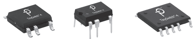
SO-8C (D Package)