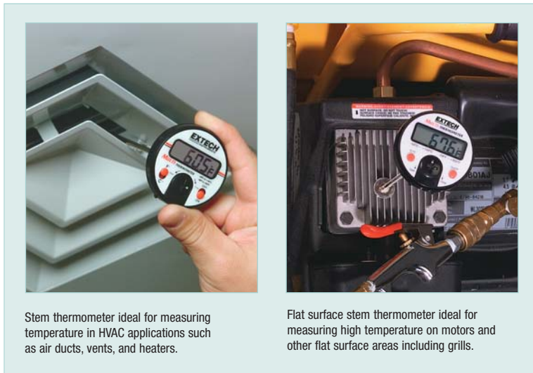
Stem thermometer ideal for measuring temperature in HVAC applications such as air ducts, vents, and heaters.