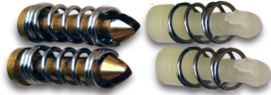
Push Pin Spring Kits