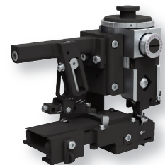
Atlantic-Style SF Mechanical