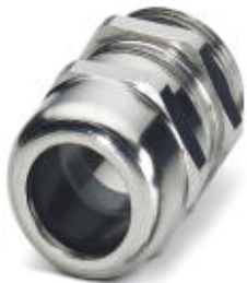
Cable gland, Cable gland material: Brass, nickel-plated, External cable diameter 19 mm ... 28 mm, Shielding: No, Connecting thread: M40, Color: silver

Please be informed that the data shown in this PDF Document is generated from our Online Catalog. Please find the complete data in the user's documentation. Our General Terms of Use for Downloads are valid ( http://phoenixcontact.com/download )