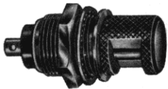
4-1930-2900-201 (without filter)