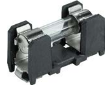
OGN-SMD equipped with fuse

500 VAC · 4 W/16 A (VDE) · 500 V · 16 A (UL/CSA)