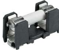
OGN-SMD equipped with fuse