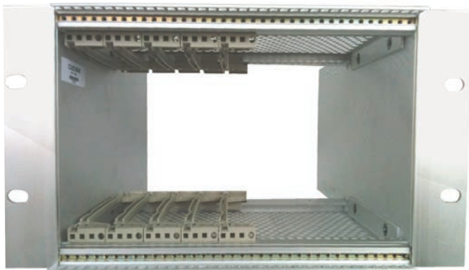
3U Subrack P/N CCA27-36-01 shown with 5 pairs of CG3-160 card guides (1 pair provided with rack)

Subrack Contents (Generic): for 3U & 6U Subracks