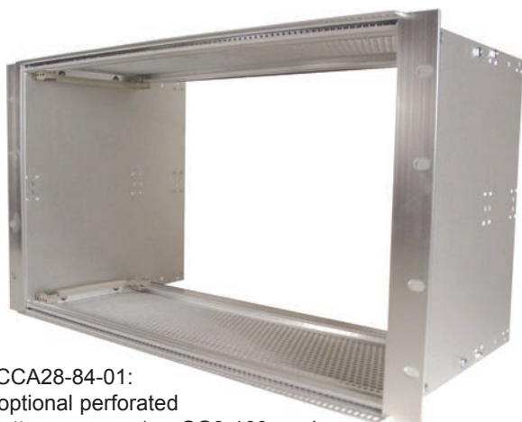
P/N CCA28-84-01: with optional perforated top/bottom covers. 1pr. CG3-160 card guides included

EMC subracks for Compact PCI, VME64X or PXI are available off-the-shelf in assembled or kit form. Standard 19" width or custom sizes available (contact factory). Can accommodate all 3U (single height, 3.937" or 100mm) and 6U (double height, 9.187" or 233.35mm) 0.062" to 0.100" thick boards.