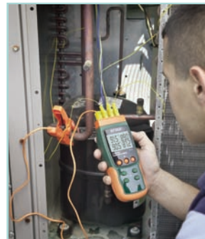
Simultaneously measures 4 temperature inputs for multiple source monitoring