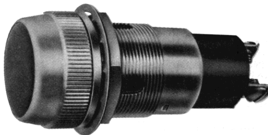
104-3101-0211-403 Flat lens

Recognized under the component program of Underwriters' Laboratories Inc.