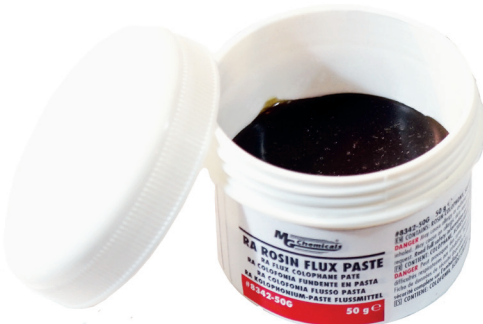
#8342-50G (50 g)

A RA Rosin Flux Paste superior electronic grade flux paste system that makes SMD electrical and electronics soldering faster and easier. It is designed for lead-free alloys, but it works well with conventional leaded solder. It is easy to apply and stays on the area where it is applied, and a little bit goes a long way. It does not contain any Zinc Chloride or Ammonium Chloride. Post soldering residues removal is much easier due to the organic acid base of the flux.