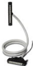
Assembled round cable with two molded 40-pos. socket strips (1:1 connection). Cable length: 14.0 m

Please be informed that the data shown in this PDF Document is generated from our Online Catalog. Please find the complete data in the user's documentation. Our General Terms of Use for Downloads are valid ( http://phoenixcontact.com/download )