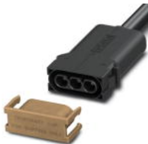
SUNCLIX micon mains connector for the socket side, 3-pos., IP67, 20 A, 600 V, trunk line: 1.0 m, incl. dust protection cap, North American version

Please be informed that the data shown in this PDF Document is generated from our Online Catalog. Please find the complete data in the user's documentation. Our General Terms of Use for Downloads are valid ( http://phoenixcontact.com/download )