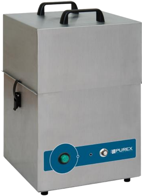
Fume Cube Max

Recirculating fume extraction is now extremely important with the rising concern for our environment and employee safety. Purex Fume Extractors provide not only a flexible and portable process for plant redesigns and expansions, but also a more stable process by providing a controlled airflow to remove harmful fumes. All this while eliminating the added costs of building modifications, increased air handling systems and lost energy.