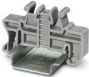
The illustration shows the version in gray

Please be informed that the data shown in this PDF Document is generated from our Online Catalog. Please find the complete data in the user's documentation. Our General Terms of Use for Downloads are valid ( http://download.phoenixcontact.com )