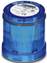
LED blinking light element, 24 V AC/DC, blue

Please be informed that the data shown in this PDF Document is generated from our Online Catalog. Please find the complete data in the user's documentation. Our General Terms of Use for Downloads are valid ( http://phoenixcontact.com/download )