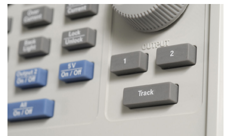
Figure 3. Simplifies Output 1 and Output 2 setup with tracking feature