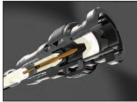
1. Cable Enters Connector

Belden offers the ability to see the cable enter the connector, and for BNC and RCA connectors, a unique pop-up pin confirms a proper termination and contact point. Being able to visually confirm the cable termination means better and faster installation.