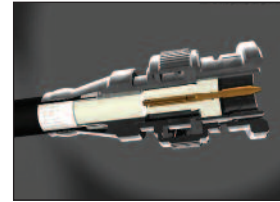
3. Pin Becomes Clearly Visible