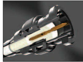
2. Pin is Pushed Through