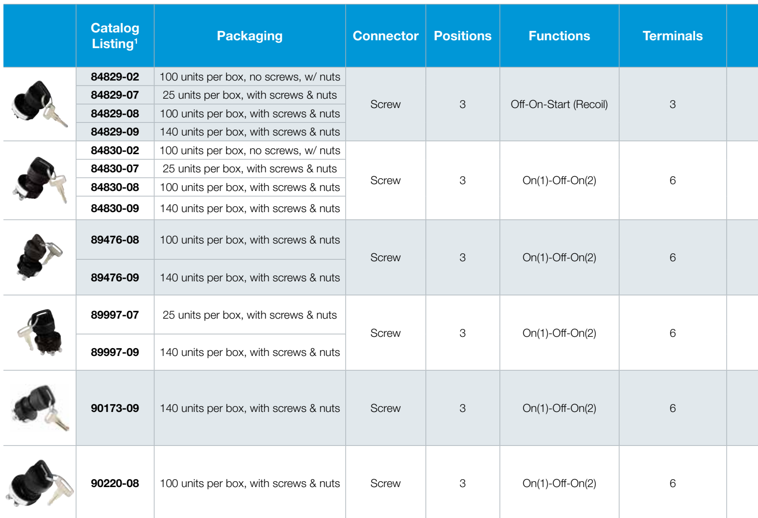
Table 2. Key Switch Order Guide and Specifications, continued

1 Numbers before the dash indicate the model number; numbers following the dash indicate the packaging option. For more information on packaging options, see Table 3.