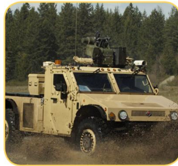
Unmanned Vehicle Control

The VG440 combines highly-reliable MEMS gyros and accelerometers with high-speed DSP electronics to provide a fully stabilized vertical gyroscope in a small and rugged environmentally-sealed enclosure. The VG440 provides consistent performance in challenging operating environments and is user-configurable for a wide variety of applications