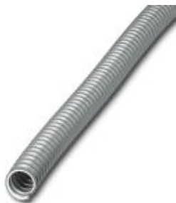
Protective hose, spring steel wire with PVC coating, highly stranded

Please be informed that the data shown in this PDF Document is generated from our Online Catalog. Please find the complete data in the user's documentation. Our General Terms of Use for Downloads are valid ( http://phoenixcontact.com/download )