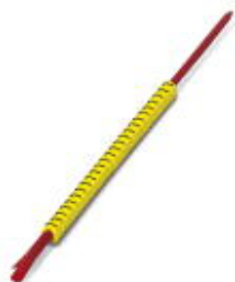
Conductor marking collar, Labeled with the number: 0, white

Please be informed that the data shown in this PDF Document is generated from our Online Catalog. Please find the complete data in the user's documentation. Our General Terms of Use for Downloads are valid ( http://phoenixcontact.com/download )