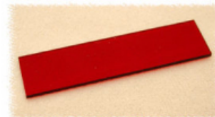
Infrared panel available (special order).