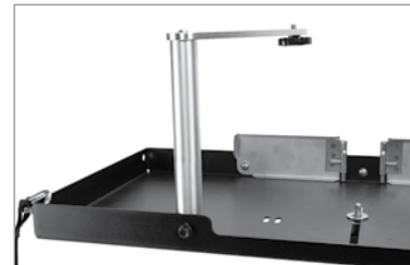
3M™ SLiC™ Fiber Splicing Workstation Cleaver Arm