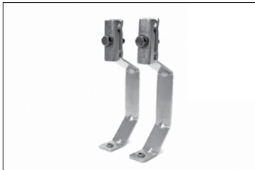
3M™ Offset Hanger Bracket AC-HB4