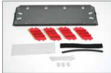
3M™ Fiber Optic Splice Tray 2527

3M, SLiC and Scotchlok are trademarks of 3M Company.