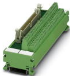
VARIOFACE module, with screw connection and flat-ribbon cable connector, for assembly on NS 35/7.5, 20 positions

Please be informed that the data shown in this PDF Document is generated from our Online Catalog. Please find the complete data in the user's documentation. Our General Terms of Use for Downloads are valid ( http://phoenixcontact.com/download )