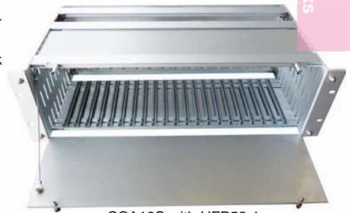
CCA13S with HFP52-1

These are designed for use as a front "drop-down" panel with lanyard for holding the panel at 90°. Provides a work surface and prevents damage to equipment. Comes complete with hardware and full instructions. Panels are 1/8" thick brushed aluminum with clear irridite finish.