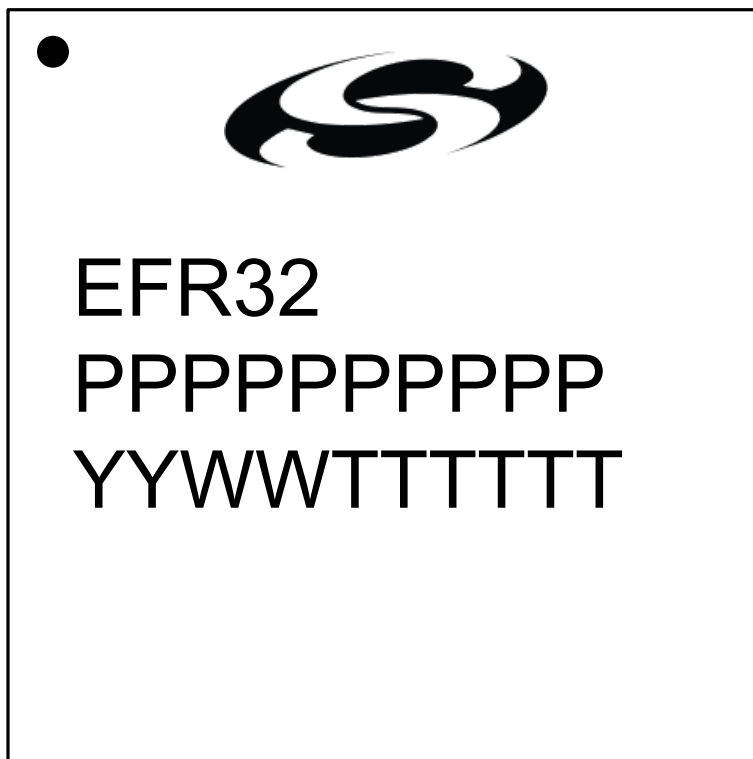
Figure 9.3. QFN68 Package Marking