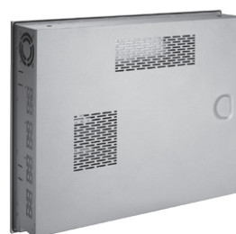
▲ Less screw design