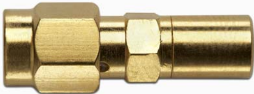
Model 72977 SMA (M) TO SMB (F)

High bandwidth, small size, and durability for confident connections.