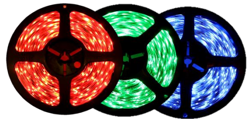
Red Green Blue Available in NB & SB Only NB, SB & UB Only