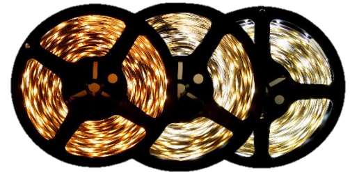
Warm White 3000K Pure White 4200K Cool White 6000K

Inspired LED Flexible Strip Lights are a simple, customizable solution for all of your LED lighting needs. These unique strips can be cut to length and terminated with solderless end connectors for easy DIY installation. Energy efficient, with a wide range of options for brightness and color, LED Flex Strips are the perfect option for any lighting application.